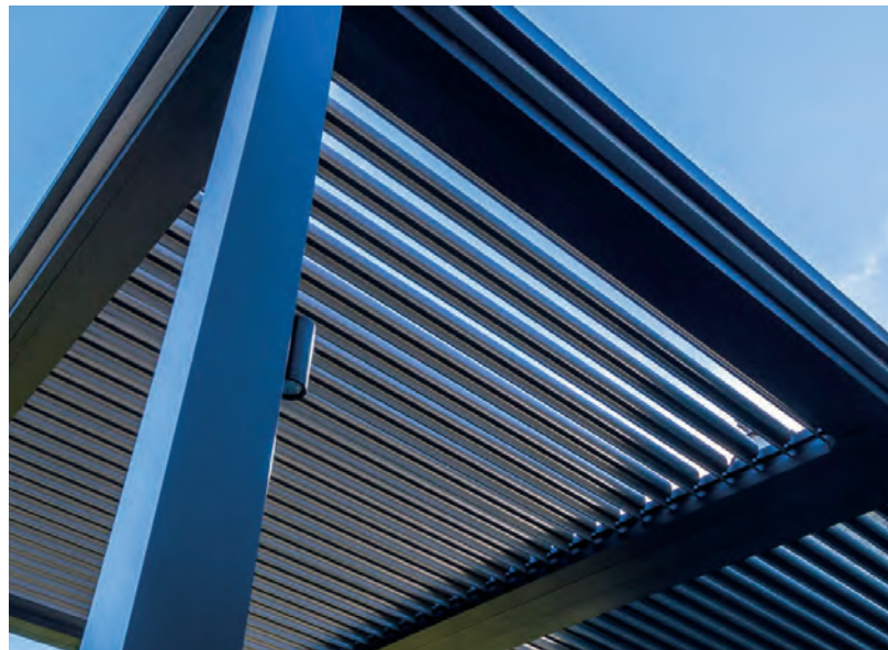
Posts & Beams