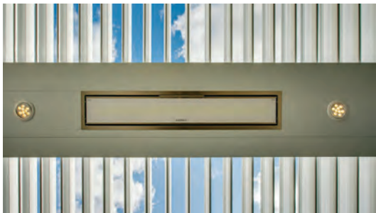
Beam Chases (Can Lights, etc.)